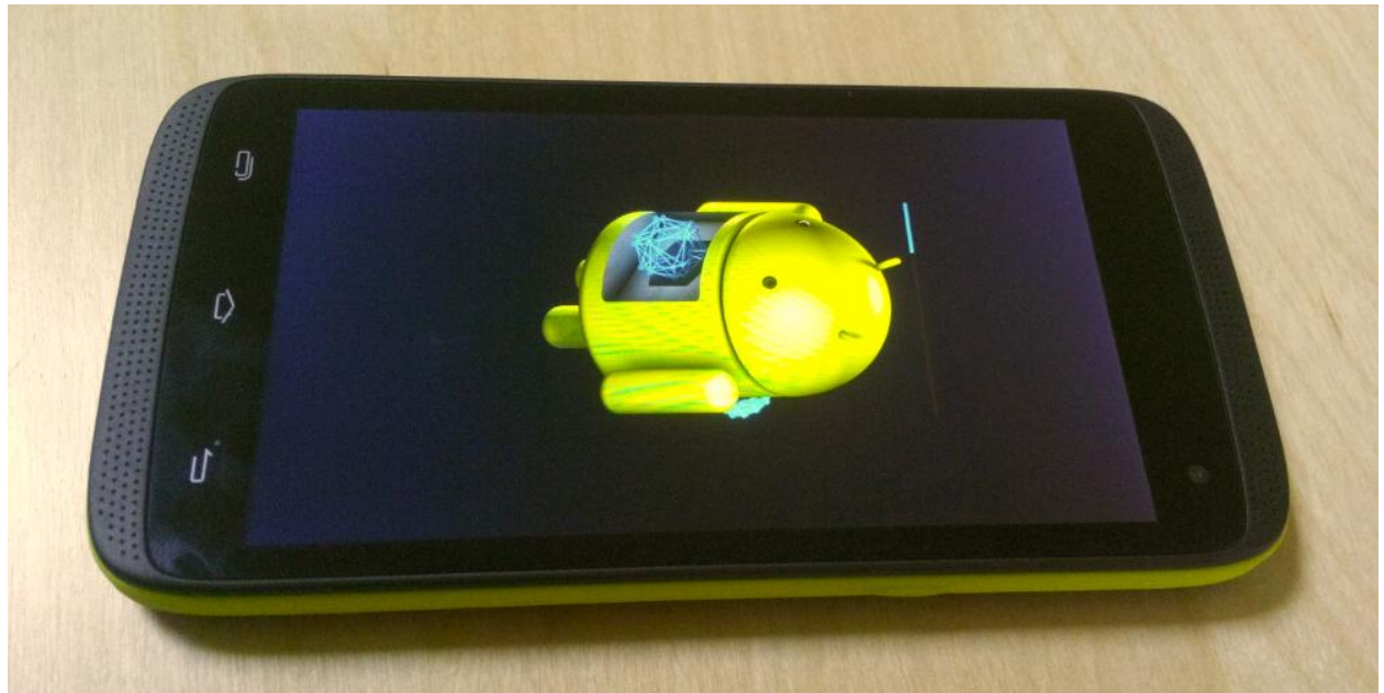
7. After finishing the update process, the phone will reboot itself.

6. Select Start The phone will reboot and the update procedure will start automatically .